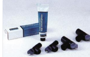
Vacuum valve / Vacuum grease