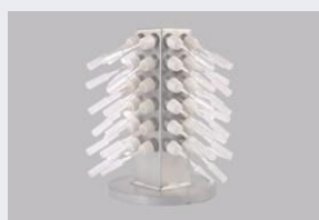
24 /52/104 Port Ampoule Adapter