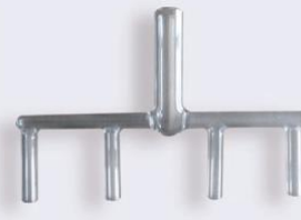
4branch glass adaptor