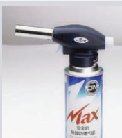
Ampoule Bottle Sealing Torch