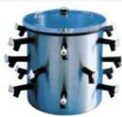
8-24 Port SS Drying Chamber (280mm height 240mm Diameter)