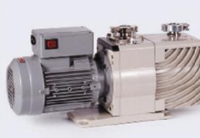
Chemical Resistant two stage rotary vane vacuum pump (100-2000LPM) with ultimate pressure (2X10 -3 ) or better