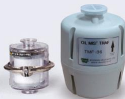
Oil mist trap (small)/large