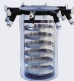
8-24 Port Acrylic Drying Chamber with Manifold and complete SS valve flask attachment