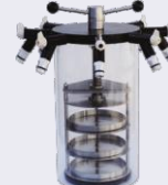
8-24 Port Drying Chamber Manifold & Stopping System with SS valve flask attachment