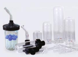
Adaptor & Cap with filter for Round and Wide Mouth Flask (50ml - 3000ml)