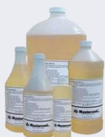
Vacuum Pump Oil