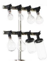
4-48 Port SS Manifold